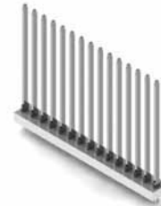
In-line board mount gold plated header assembly