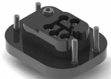
Heavy-duty terminal block for commercial flow meter