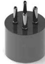
4 pin tube style header