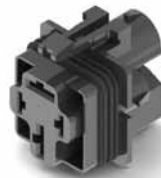
Weatherproof automotive relay connector for harnessing