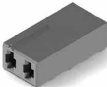
2 pin female harness interconnect device