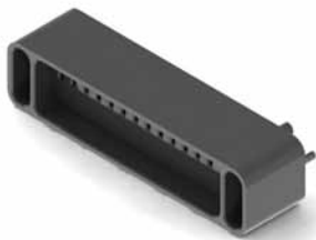
17 pin pc mount combination power and signal connector